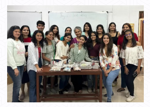
Christmas Celebration at the Department