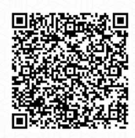
Click <u>here</u> to access the Google form.