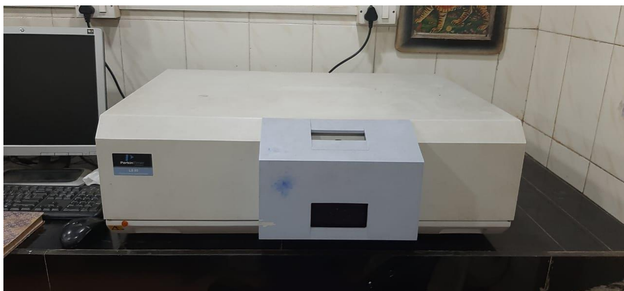
UV Visible Spectrophotometer (Perkin)