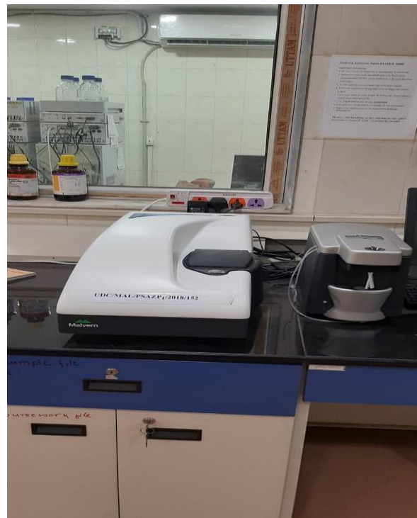
Particle size analyzer with zeta potential