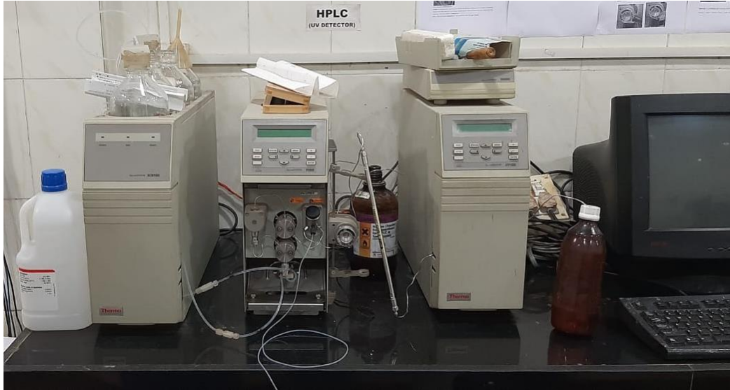
High Performance Liquid Chromatography Instrument