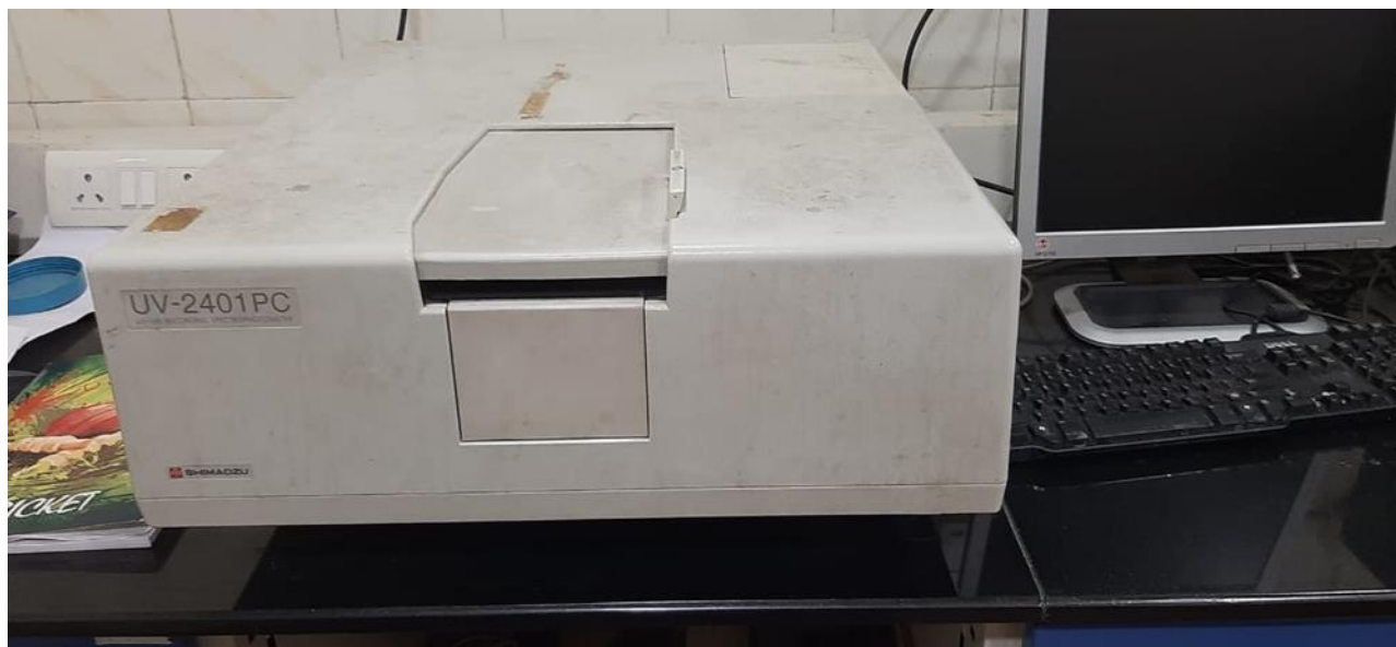
UV Visible Spectrophotometer (Shimadzu)