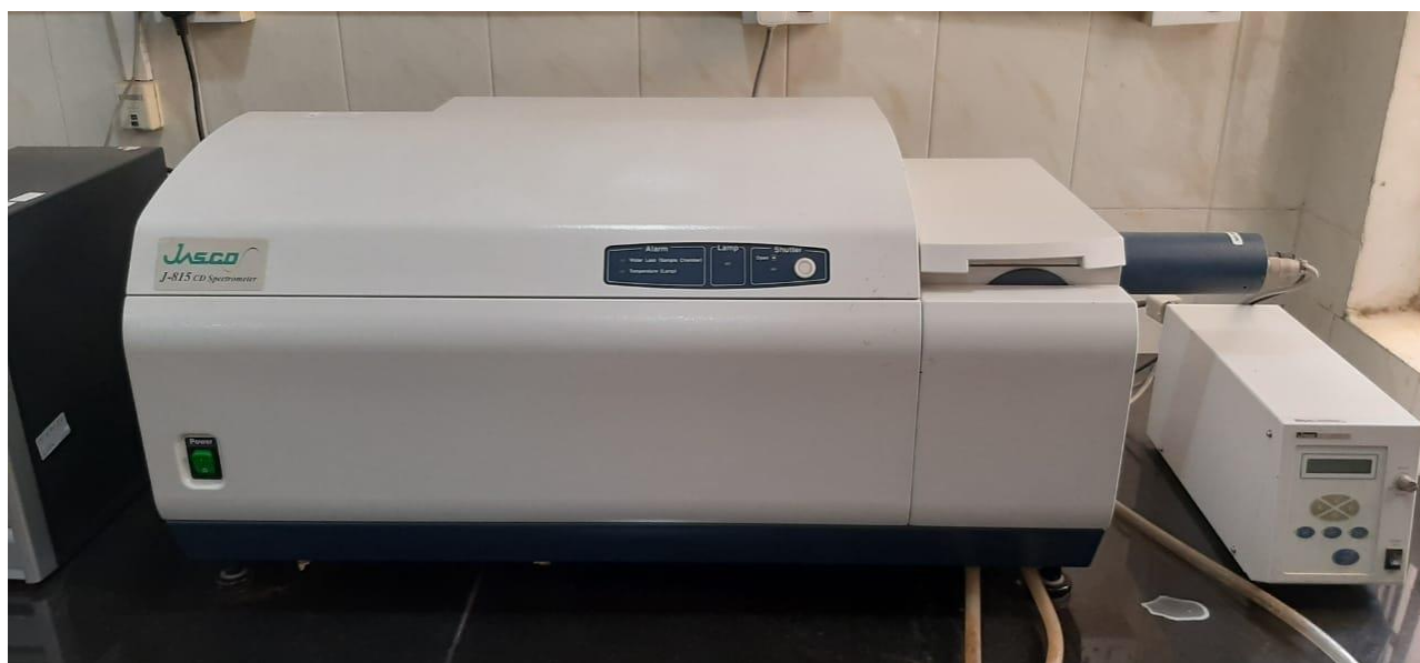
Circular Dichroism Spectrophotometer